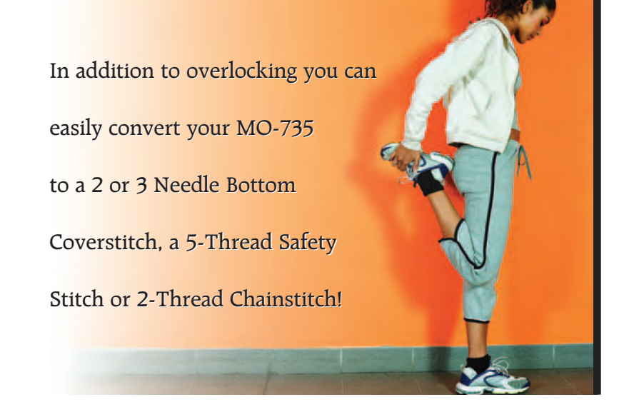
2-Needle, 2/3/4/5 Thread Overlock with Differential Feed, Chainstitch and Coverstitch